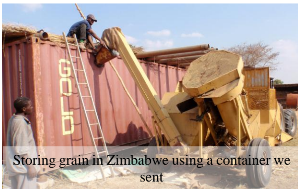
Storing grain in Zimbabwe using a container we sent