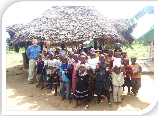
Kids at the Baobab Home in Tanzania

We continue to get regular requests for help, and thanks to your contributions, we continue to meet many needs. Some recent projects are described below.