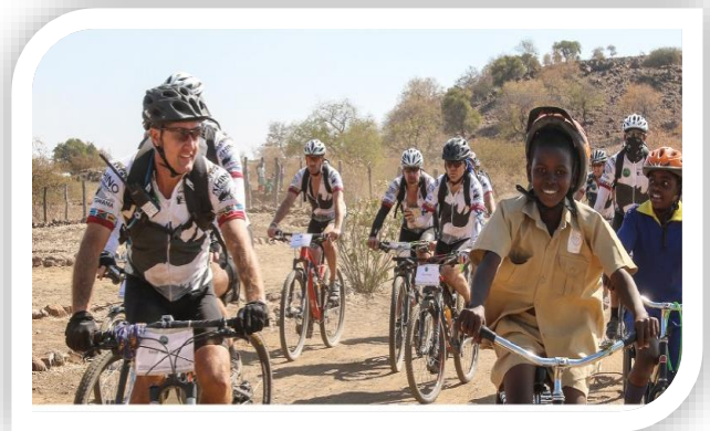
South Africa/Botswana/Zimbabwe Tour de Tuli education fundraiser!

James 1:27, 2:18 "care for the orphans and widows . . . show your faith through your works"