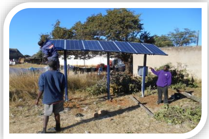
Solar powered water well in Zimbabwe

Water wells. We were contacted by Eden Children's Village in Zimbabwe to help with a water well. Due to the continued drought and electricity shortages, they lacked adequate water at the orphanage. Thus, we funded a solar powered water well for the Village. We have worked with this group for about 20 years, mostly providing support to their clinic and farm.