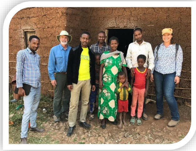
Some of my new Ethiopian friends

recently attended a conference in South Africa where he stated in his newsletter: “It was exciting to meet many AU Agriculture students that have become missionaries, using their skills to lead Agriculture development in other African countries as they take the gospel out to the communities they work with.” These are very encouraging words and an excellent example of how we are having a long-term impact in these countries. That is, we are helping to raise up educated indigenous leaders.