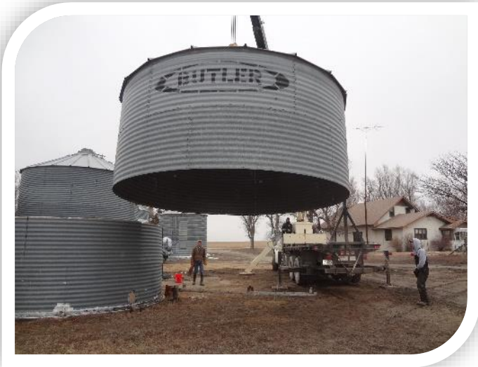
Grain bins being taken down in Palco, KS.