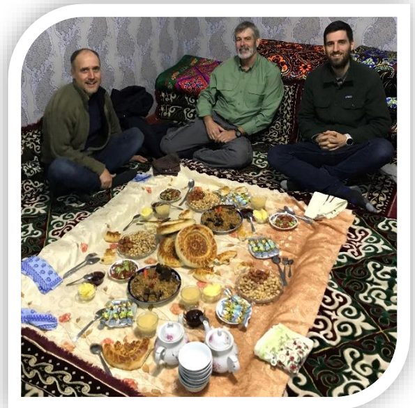
A typical meal in Kyrgyzstan