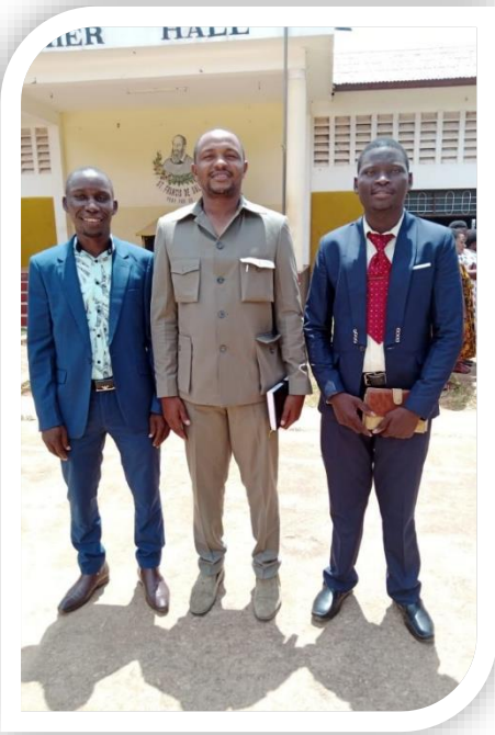
A former student (on left) that is now Chairman of the Town Council

have a long-term impact in developing countries since these students will likely become leaders in their countries where many are not able to complete school. We require students send receipts from the school when tuition is paid and to send us transcripts so we can make sure they are making C's or better. In addition, we have paid tuition for farmers to attend various agricultural short courses. When selecting students, we give preference to females and children of single mothers as they are the most vulnerable and helpless in many of these locations.