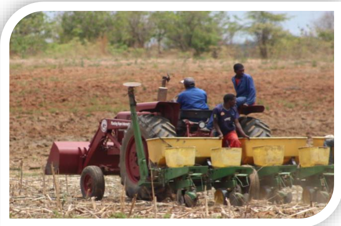
Planting soybeans in Zimbabwe

Agricultural Support. We've had fewer requests for agricultural support in recent years, but we did provide funds to buy fertilizer for the farm at Eden Children's Village in Zimbabwe and to buy sprayers for The Baobab Home in Tanzania that includes a farm and orphanage. The Baobab home is always looking for ways to be more productive in their organic farming methods and the sprayers are used to spray a Neem mixture to control insects.