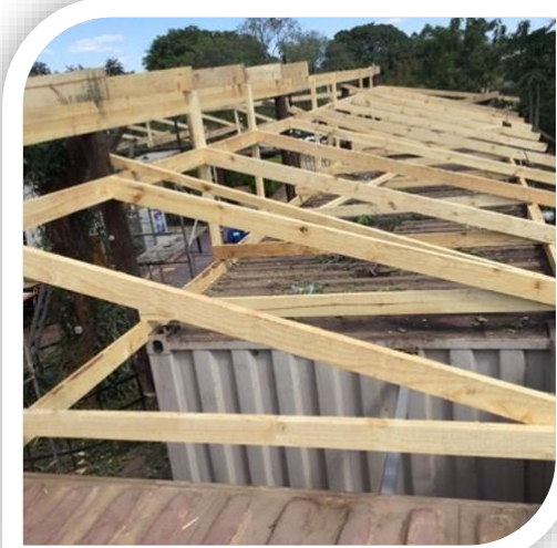
New roof being built over the clinic in Zimbabwe

A container is being loaded out of Indiana to ship to Eden Children's Village and we are sending many medications, supplies, wheelchairs, walkers, and crutches for the clinic. Hopefully that container will arrive soon and with no shipping hassles!